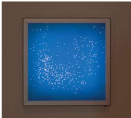
Ann Hamilton face to face Lynda, Hugh , 2008 archival inkjet print 10 x 3 1/2 in. (25.4 x 8.9 cm) Museum purchase